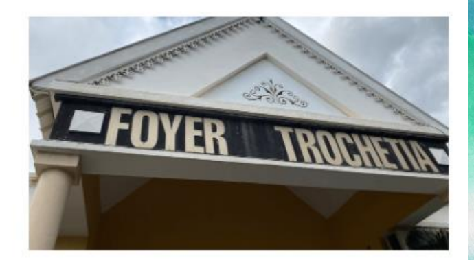
State-run aged and palliative care facility, ocated at Pointe aux Sables (Trochetia foyer)

at the non-profit facility of the Couvent de Bon Secours located in Belle Rose, Mauritius. The Groupement FIAPA office is in the compound too.